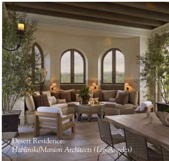
Desert Residence: Hablinski/Manion Architects (Los Angeles)