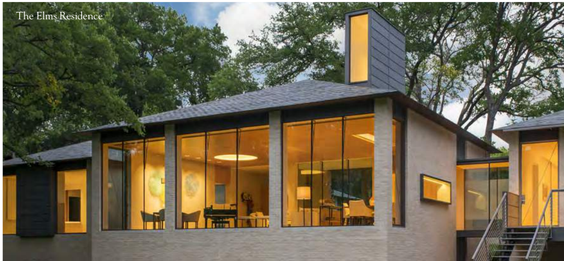
The Elms Residence