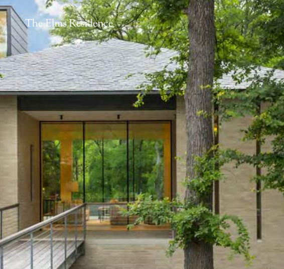
The Elms Residence