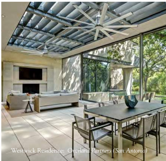
Westwick Residence: Overland Partners (San Antonio)