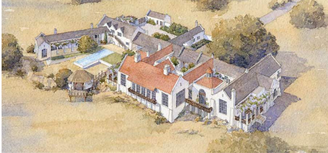
Malone Cliff Residence